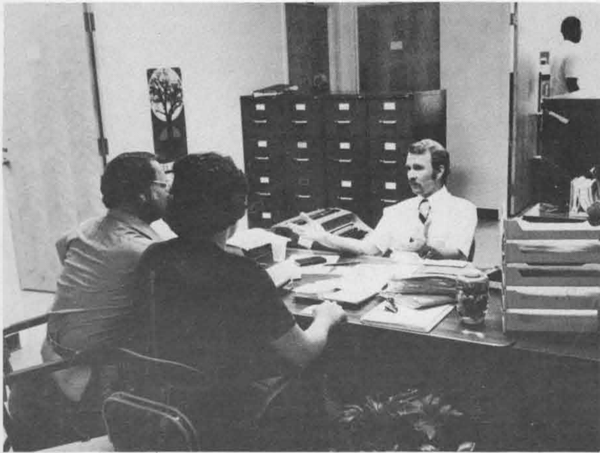
QUESTIONS?: University of Missouri-Rolla graduate engineering extension at UMSL recently held an information session for prospective students.